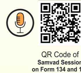
QR Code of Samvaad Session on Form 134 and 135

For the benefit of the Stakeholders, the QR code of the link to the “Samvaad” session with the officer involved in drafting of the Income Tax Act, 2025 is given hereunder :